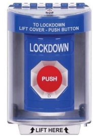
Large Wall Mounted Lockdown Button in Main Office. Concealed lockdown buttons are also used.