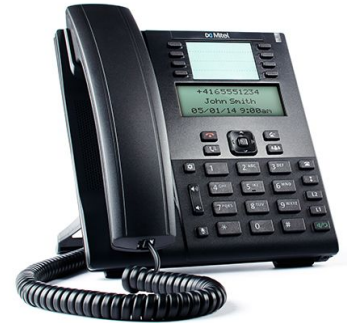
Standard Classroom Desk Phone