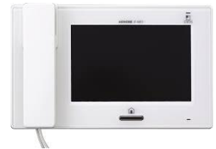
Interior Desktop Doorbell Station with Video Display, Speaker and Microphone