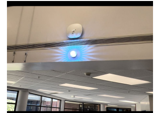
Interior Blue Light Activated