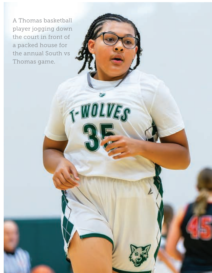
A Thomas basketball player jogging down the court in front of a packed house for the annual South vs Thomas game.