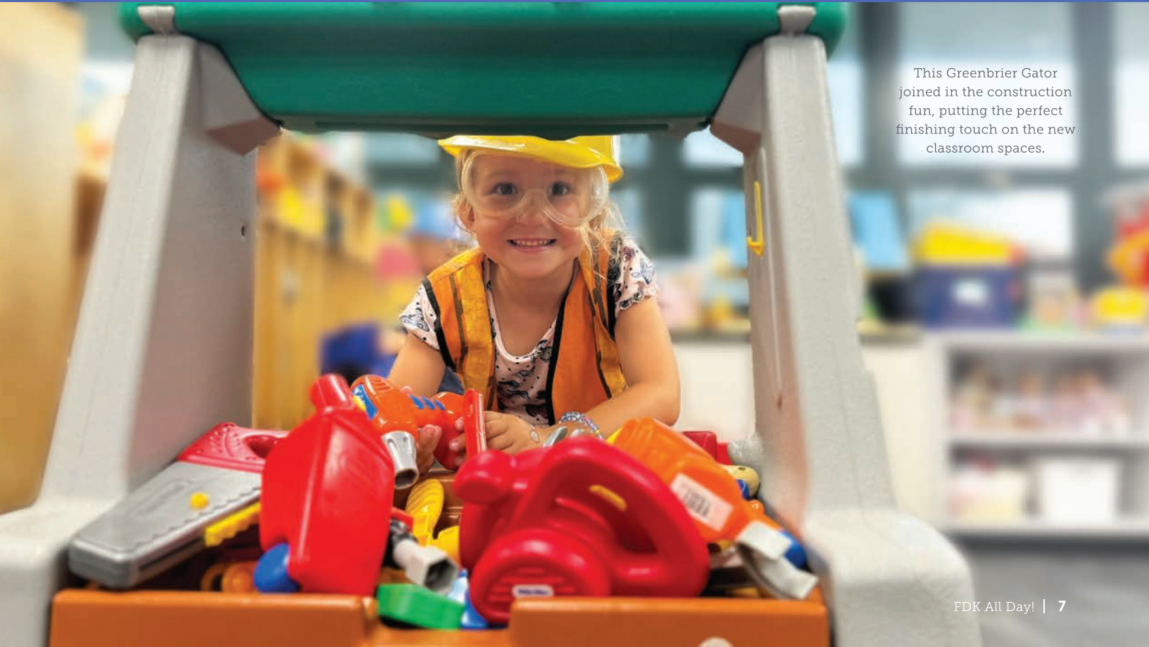
This Greenbrier Gator joined in the construction fun, putting the perfect finishing touch on the new classroom spaces.