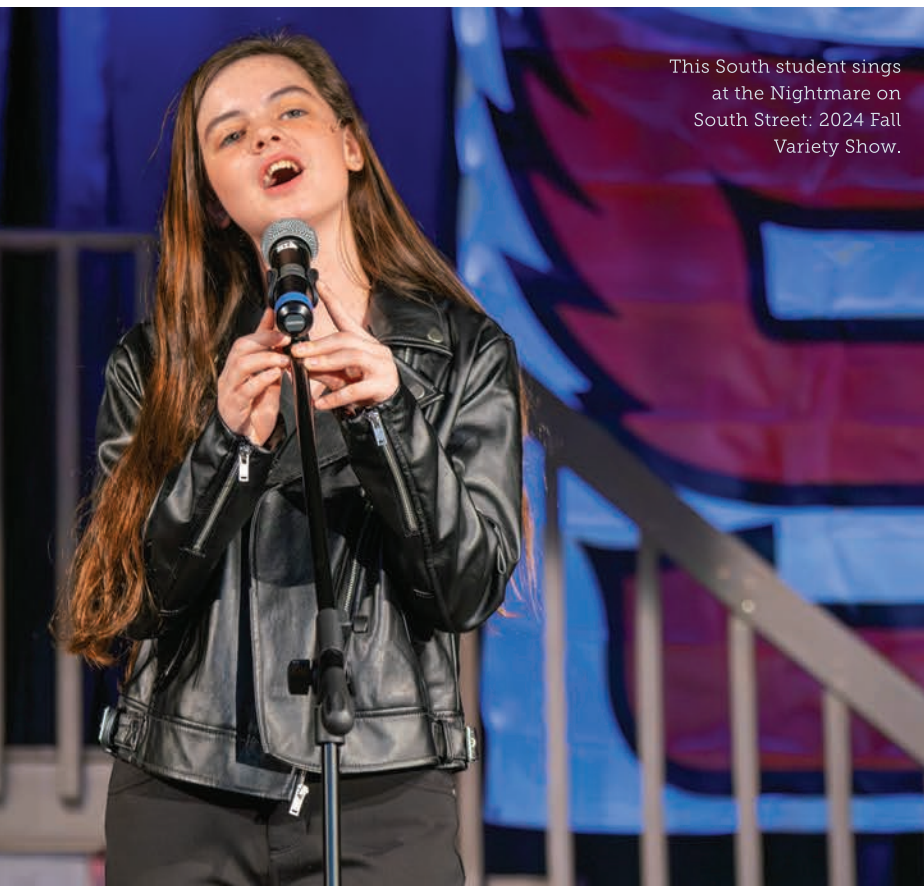
This South student sings at the Nightmare on South Street: 2024 Fall Variety Show.

Let our kids tell you what's happening in d25 by visiting www.sd25.org/Stories .