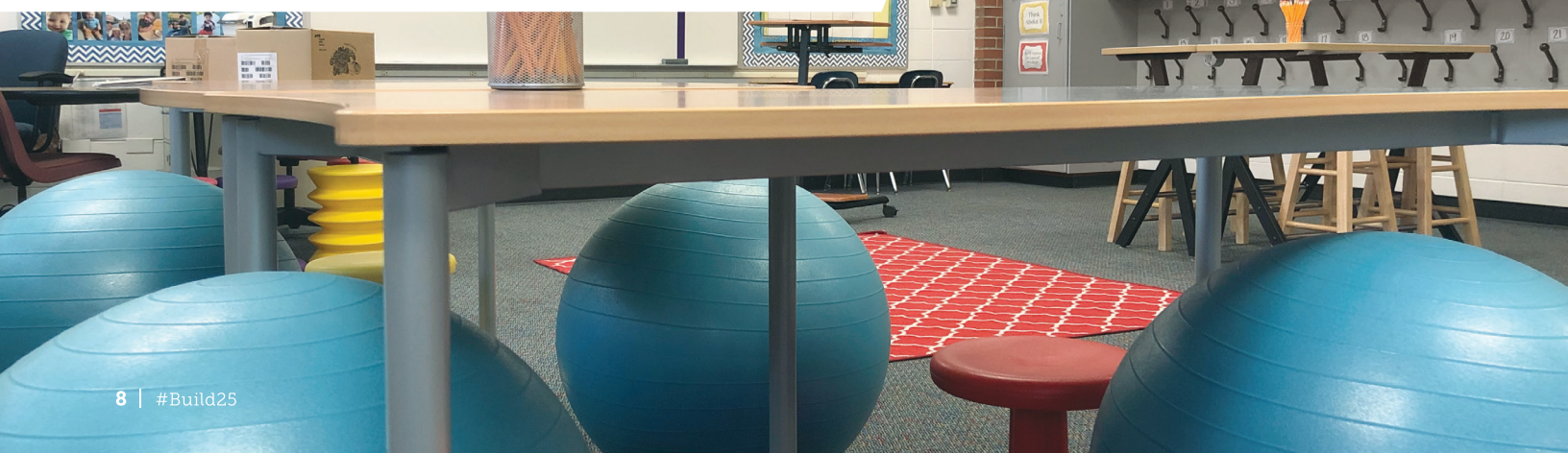
IMAGE ABOVE: New gym built at Ivy Hill (2016). BELOW: Flexible learning spaces have become common in District 25 classrooms.